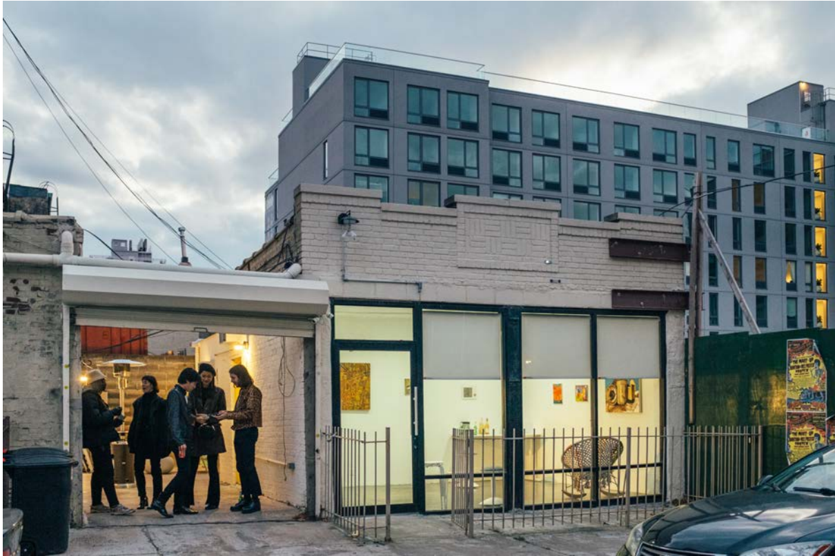
Storefront after dark