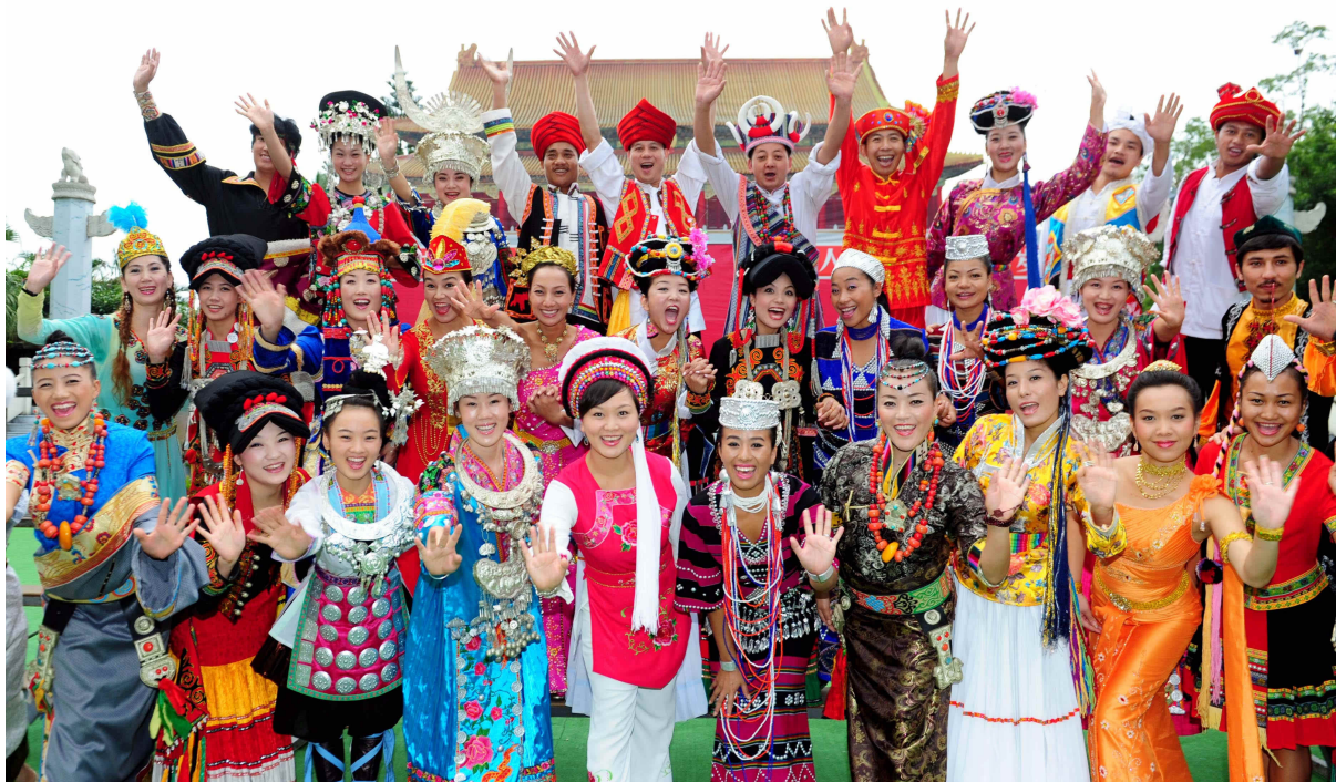
*Young minority actors/workers dress in their own ethnic garments at Splendid China Folk Village theme park in Shenzhen, China